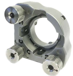
MHX-25.4F-R with optional knobs (sold separately)