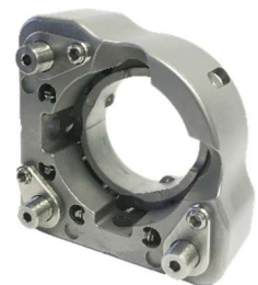
MHX-25.4F-R with optional locks (sold separately)