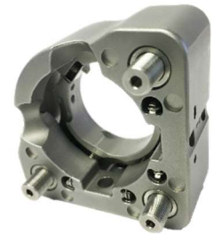
MHX-25.4F-R mount, rear view